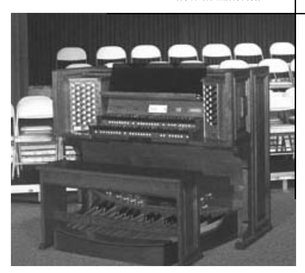
Rembrandt 2900 White Horse Village Auditorium Newtown Square, PA

European quality and design now in America